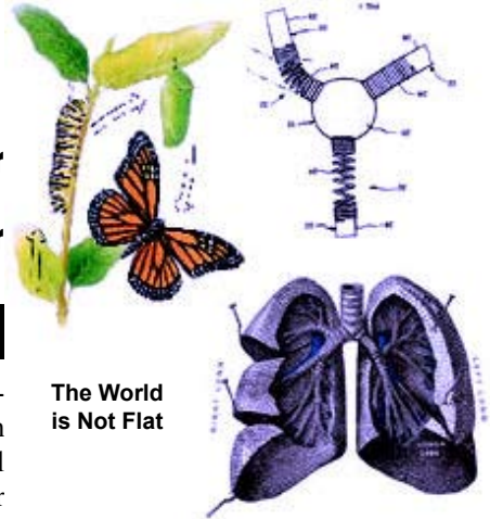
The World is Not Flat

Science is moving slowly and being dragged kicking and screaming into a belief of the ancient concept of the aether... a universal energy that is the basis for all of the natural forces as well as its manifestation as matter. Orthodox science has been resisting the concept ever since the faulty Michaelson/Morley experiments could not find an aether drift close to the earth's surface even though its existence was proven in many later experiments. If science wants to really make progress then the scientists in all areas of endeavors must get into an understanding of the higher order aspects of aetheric energy.