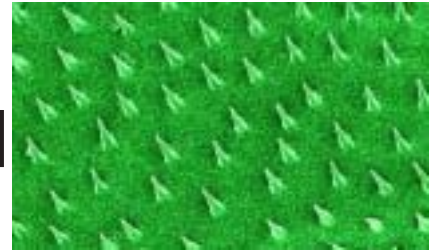
Scanning Electron Micrograph of a June Bug Inner Wing at 1000X.